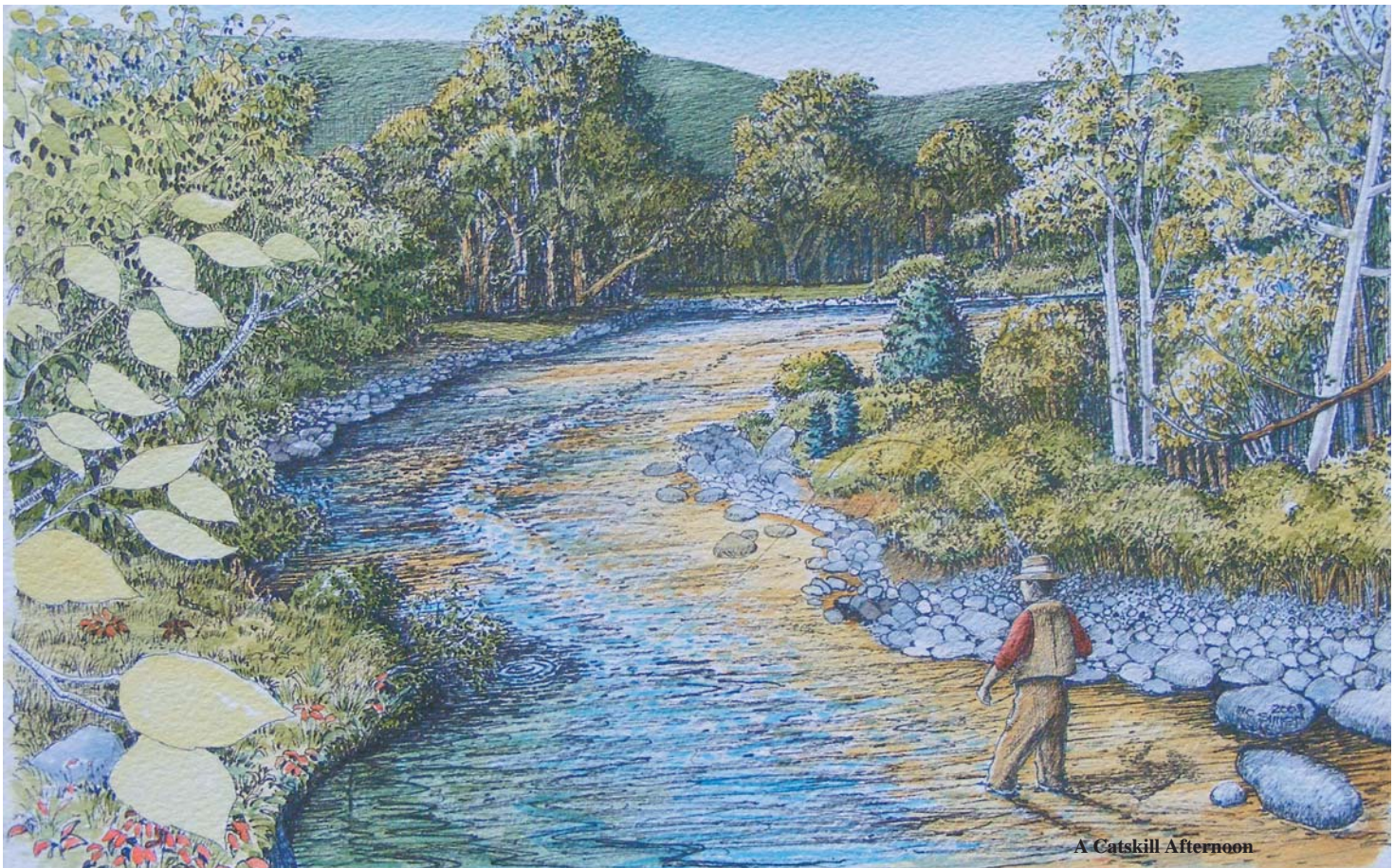
A Catskill Afternoon