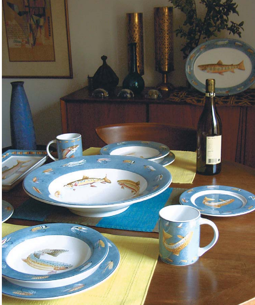
The artist's line of fine china