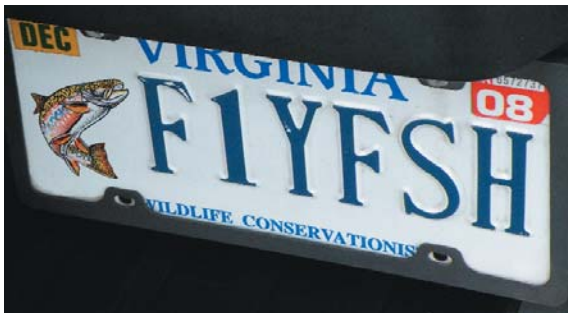
The Virginia brook trout license plate