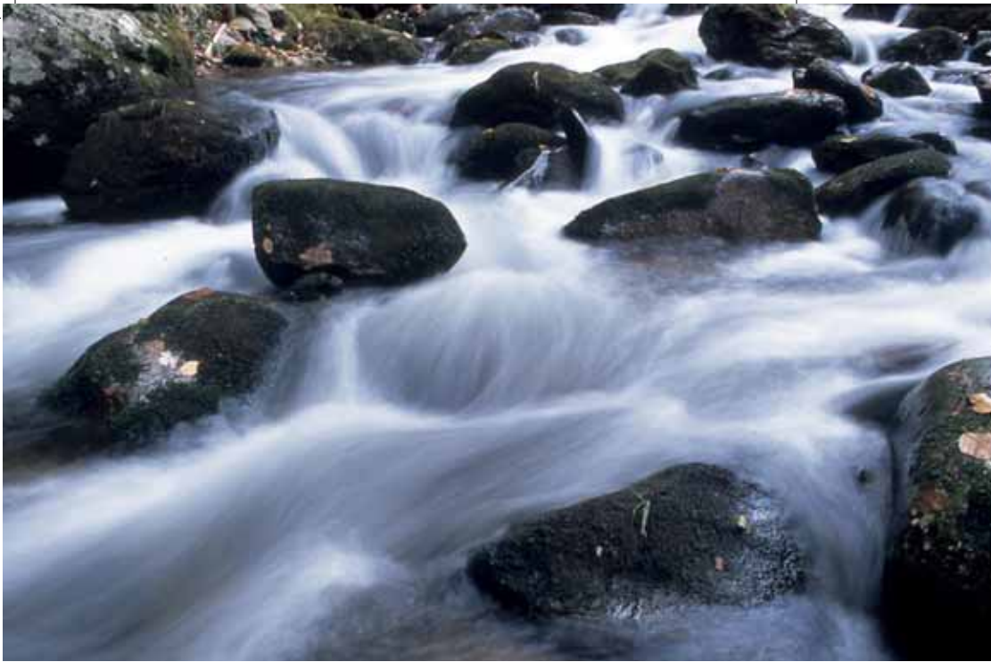
The rich feeder streams throughout Virginia provide the ideal habitat for wild trout.

pools. Many of the March Brown nymphs move from the middle of the streams to the sides of the pools prior to hatching and are exposed to the trout during this mini-migration. By carefully watching the foot-deep water on the sides of the pools you can often observe the trouts' splashy feeding on these nymphs. Some of these trout will take the Mr. Rapidan Dry Fly, but oth-