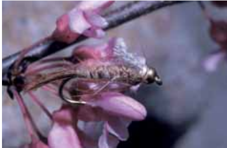
The Mr. Rapidan Bead Head Nymph is a great fly to use in periods of high water in the spring.

start returning to the stream for their beautiful mayfly mating dance about two hours before dark and continue until dark. Consequently, during the last hour of the day you have the greatest concentrations of Sulphur duns and spinners on the water, and the trout go on a feeding spree.