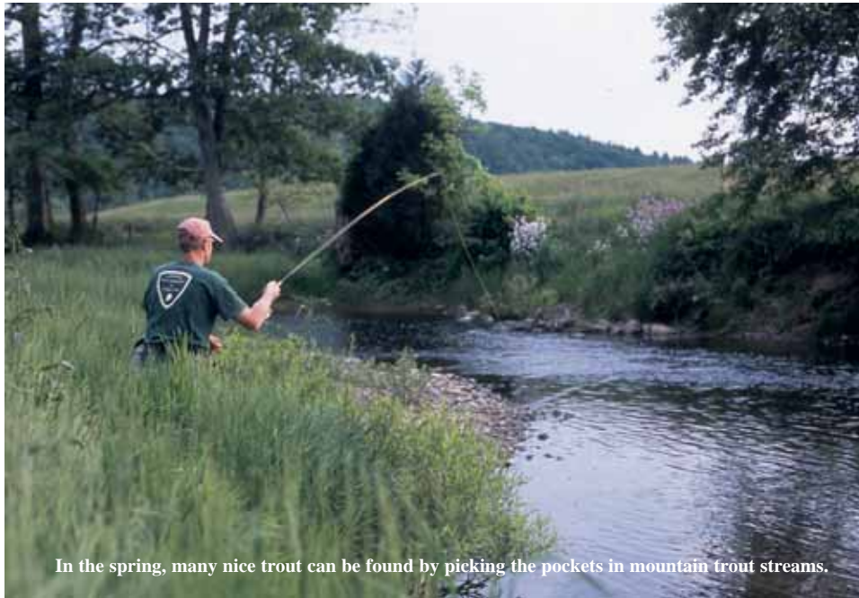
In the spring, many nice trout can be found by picking the pockets in mountain trout streams.