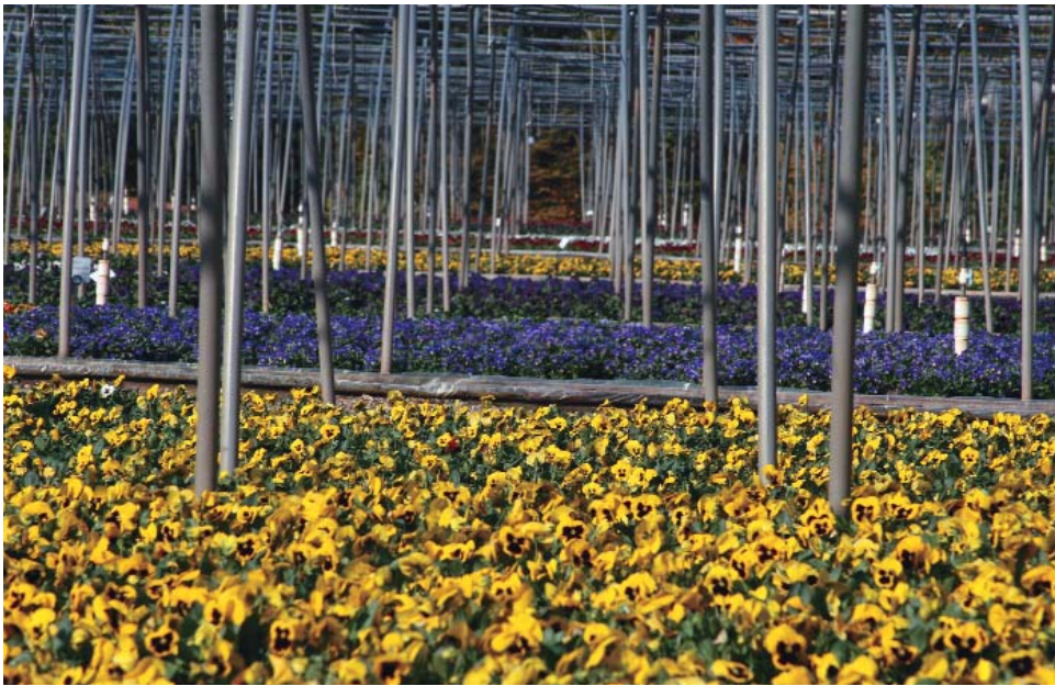
Pansies seem to stretch as far as the eye can see at the Saunders Brothers 60-acre bedding plant and shrub nursery near Piney River. The family-owned and operated enterprise also grows 120 acres of apples and 40 acres of peaches.