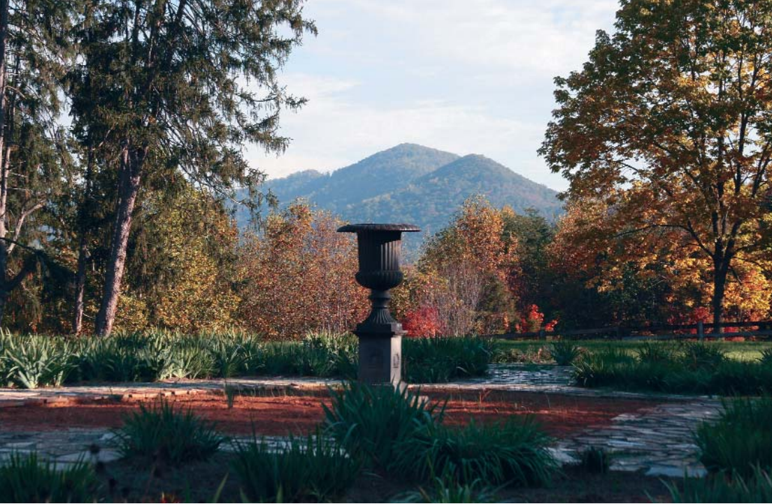
The formal Italian garden at Oakridge Estate serves as an elegant backdrop for events, weddings, photo shoots and movie sets.

make your way back to that road and head south. Turn right at the sign that says to Piney River. You'll soon come upon Saunders Brothers' orchard and nursery.