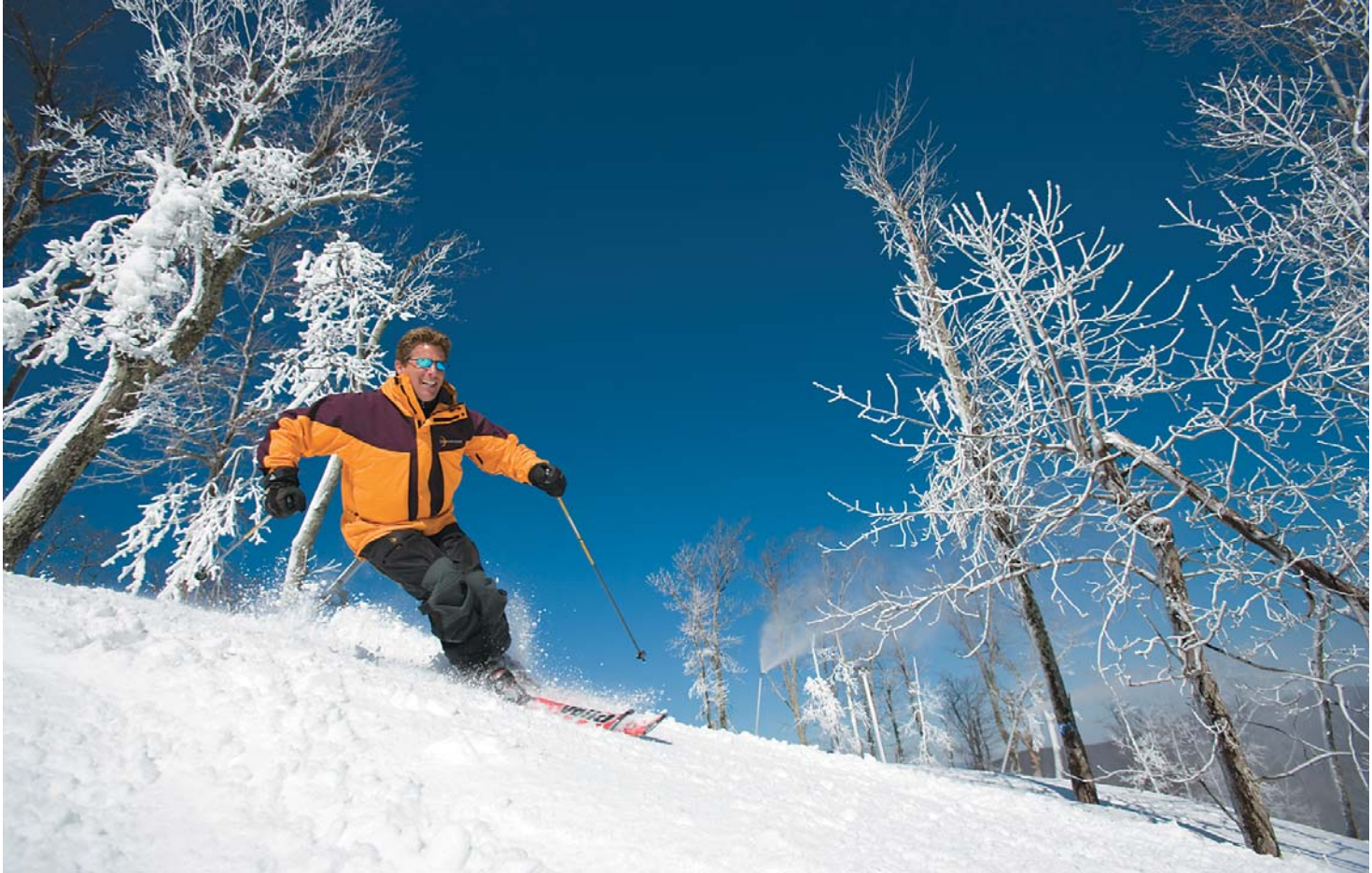
The slopes at Wintergreen offer 1,000 vertical feet of skiing on 26 trails, as well as two tubing parks and one terrain park. In early spring, you can sometimes ski in the morning and golf that afternoon at the bottom.

service restaurants, before you collapse onto your bed in one of 300 villa-style condos. And there's more: You can get married here, you can have a conference here and you can park your kids here. The Dome features all kinds of cool games and activities for the younger set. Also, there's 30 miles of hiking trails, a 20-acre lake, and at Rodes Farm at the bottom, horseback-riding stables.