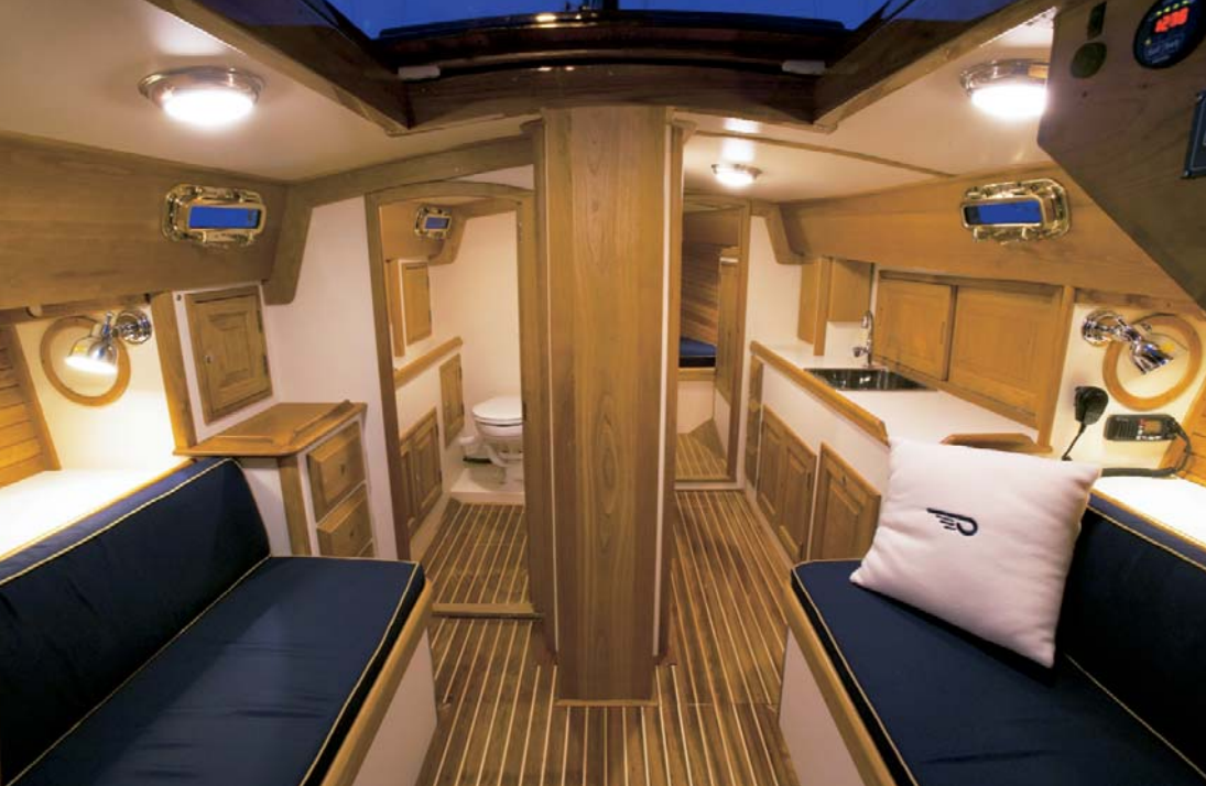
Down below continues to speak of the beautiful design and elegance of a Hinckley built yacht.

the vessel sits before a large wheel beautifully trimmed in teak. Just below the wheel, are the six sail trimming buttons, easily operated at the touch of the foot or hand. The joy stick, available to operate an auxiliary electric power unit, is conveniently mounted on the binnacle, within easy reach of the helm seat.