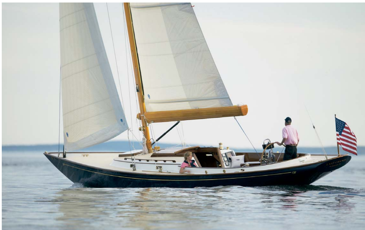
The DS42 sails beautifully with just a whisper of wind.