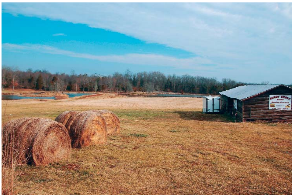
The retriever training pond at Shady Grove

ers practicing for an upcoming field trial. And even with all that commotion, we actually bumped a wild covey of quail with my truck as we drove around the edge of the property. Hunt Haven is by reservation only and is ideal for the experienced hunter who has his own dogs and wants a very