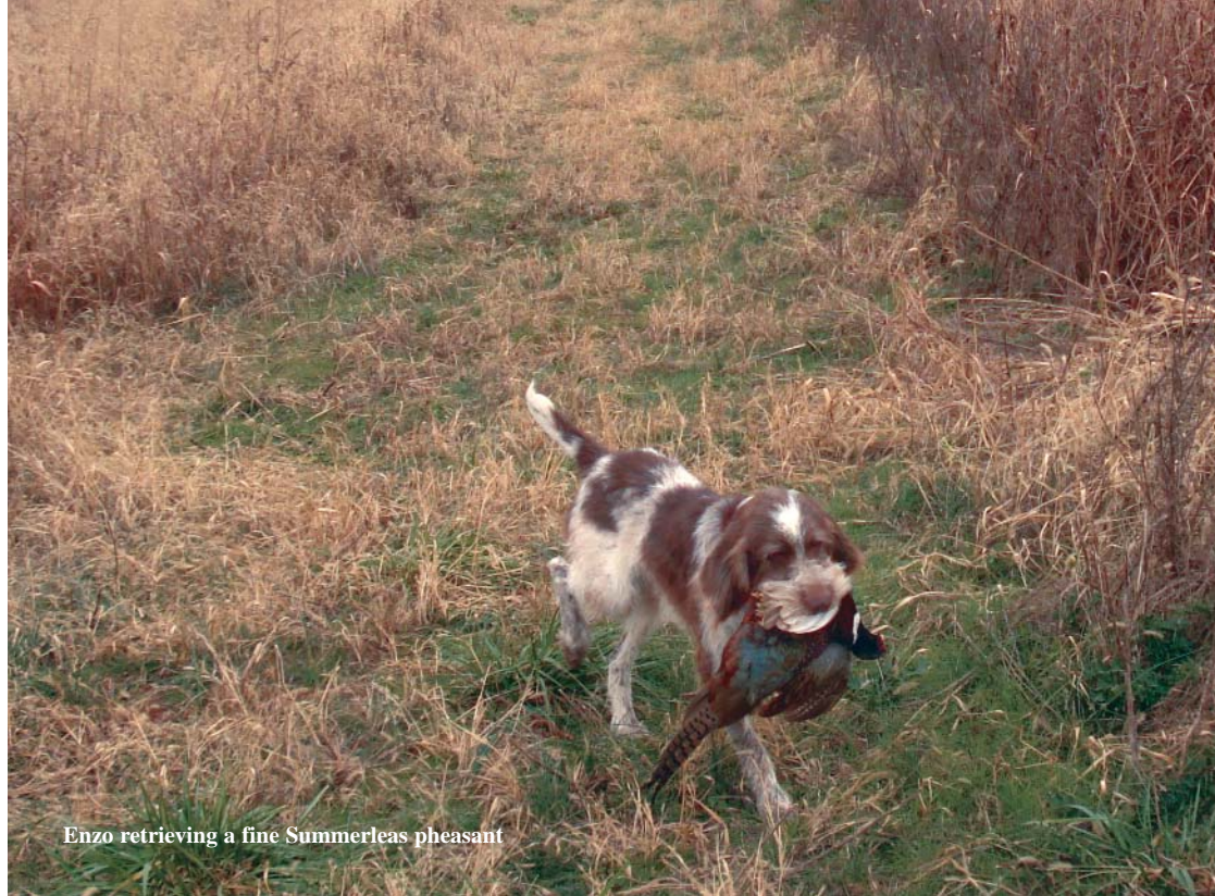
Enzo retrieving a fine Summerleas pheasant