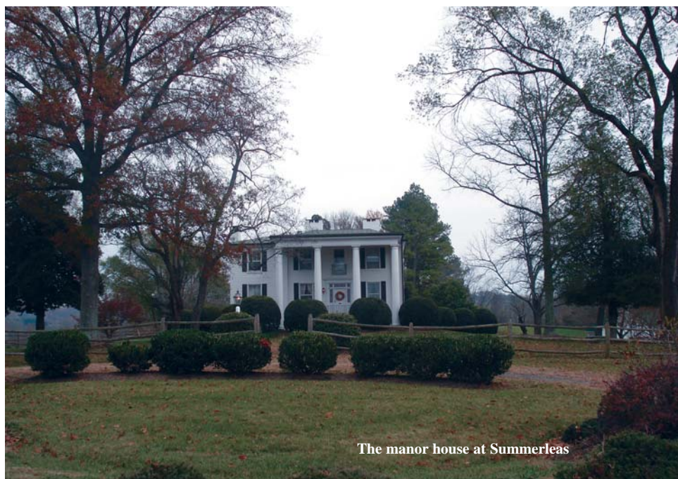
The manor house at Summerleas