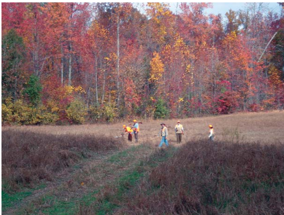
A Spinone preparing for a field trial at Hunt Haven