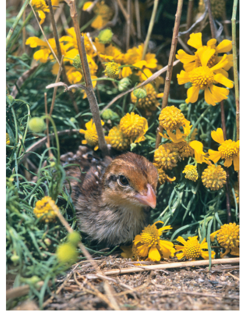
A newly hatched Bob White chick

looking into the correlation of mouse population to quail population. The concept is simple but ingenious. Quail and mice have many of the same predators (fox, hawks and snakes) and also incorporate many of the same seeds as part of their food source. Interestingly, the mouse population has also seen a decline.