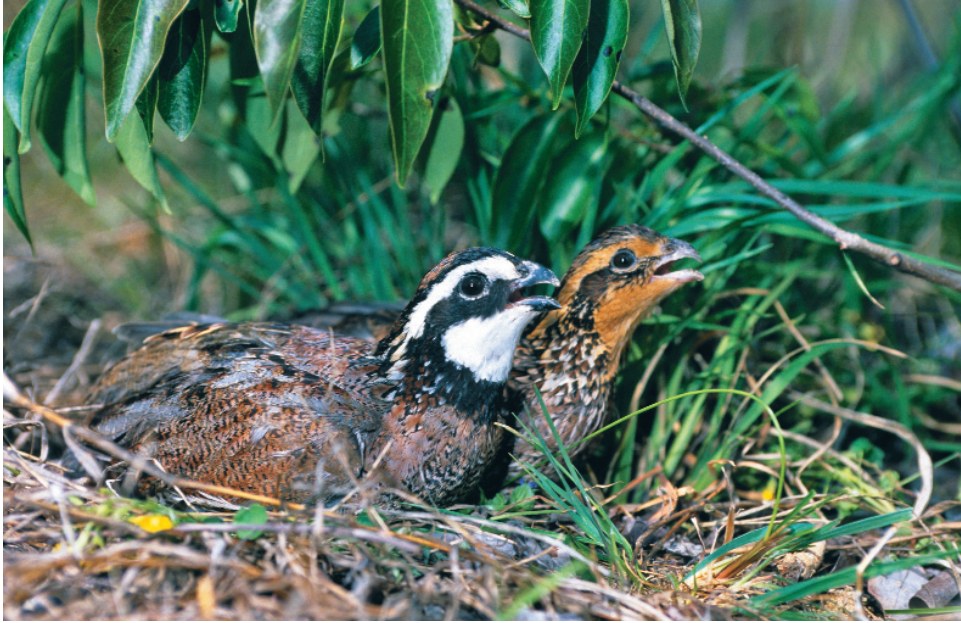
Male and female Bobwhite Quail