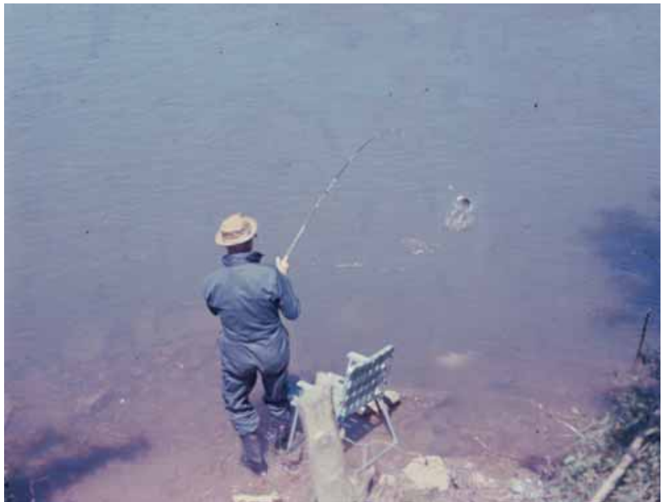
Angler with shad on Rappahannock

Moving on, we have one more call to make. We must distinguish the hickory shad from the American shad, which is often called the white shad here in Virginia. In this case knowing the difference between the shads is more than academic. The taking of white shad in the Chesapeake Bay and the rivers that flow