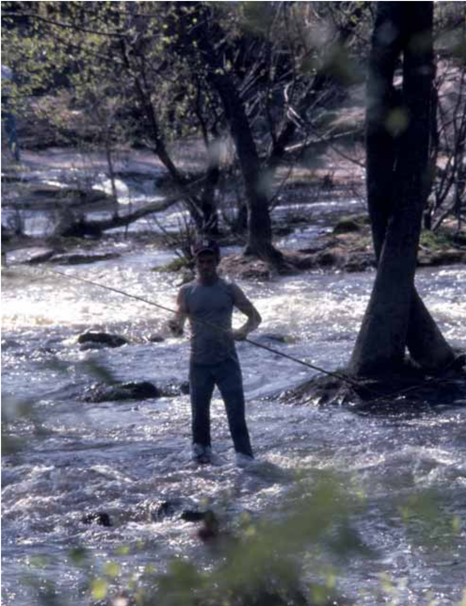
Fishing for herring on Swift Creek, Colonial Heights

mouth. On the hickory shad the upper jaw fits inside the lower jaw . The lower jaw of the American shad fits inside the upper jaw .