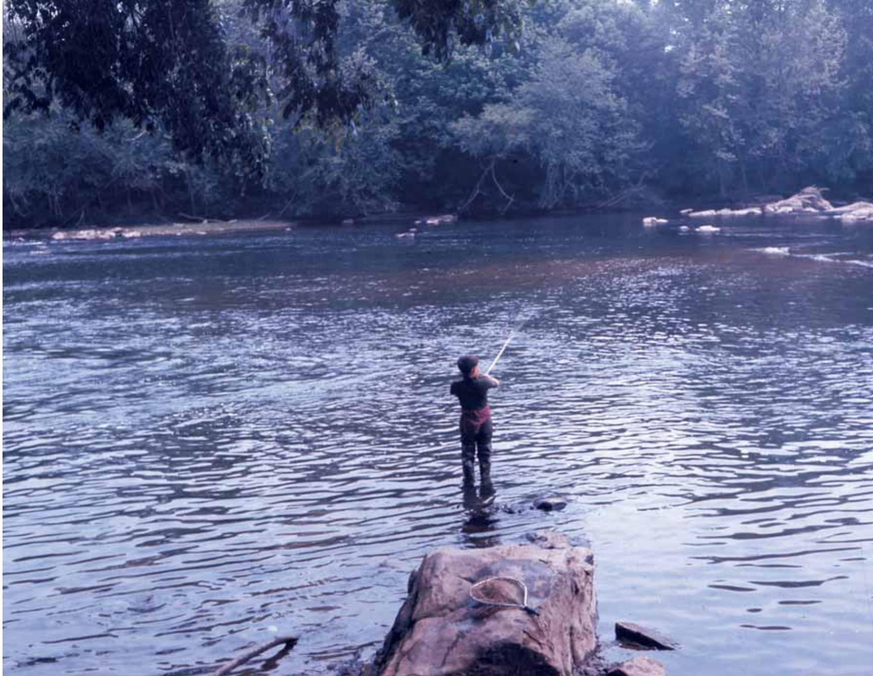
Standing on the rock below the Rt. 1 Bridge on Rappahannock