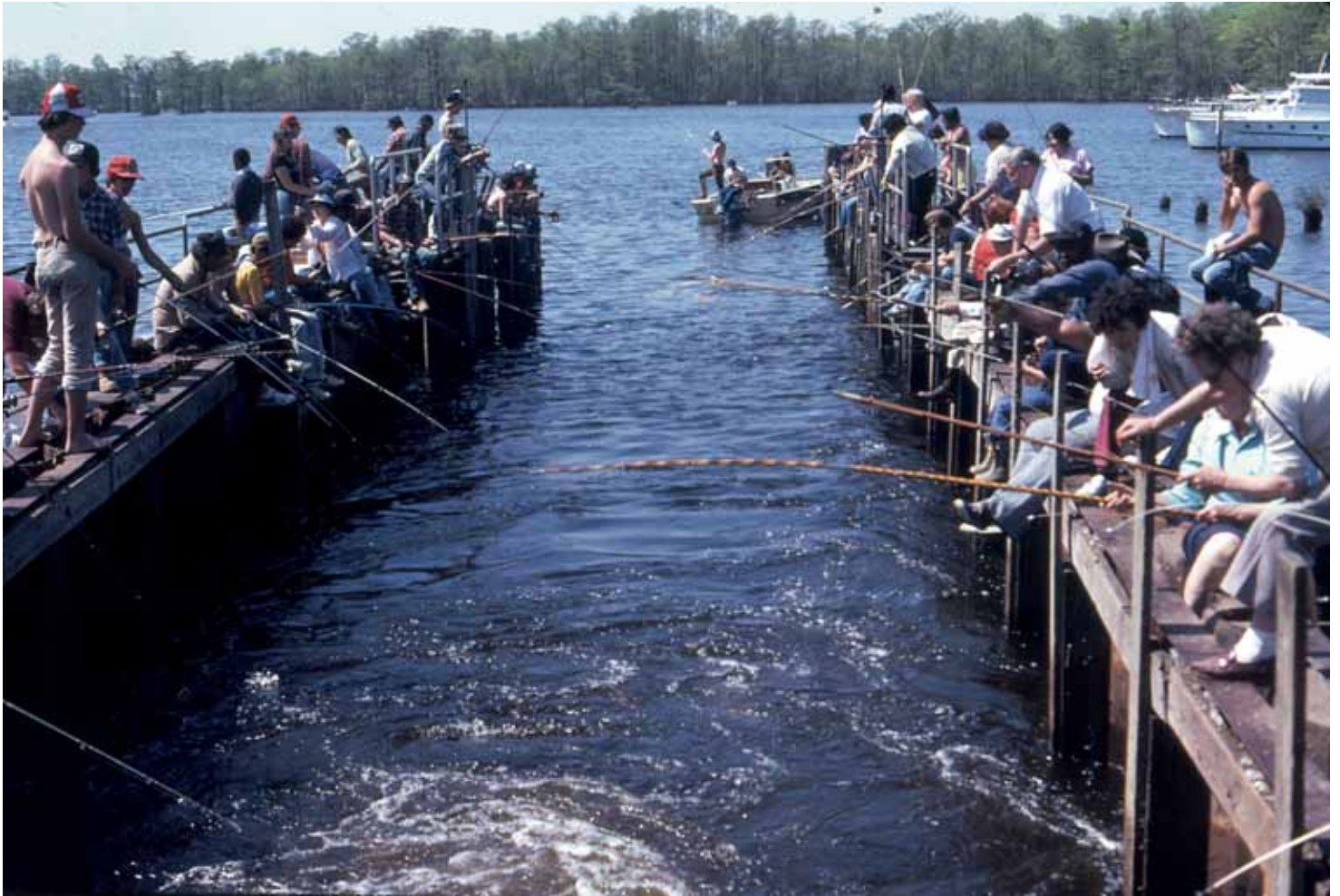
Shad angler on the Appomattox River in Petersburg

One thing I have learned about fishing - any kind of fishing - is there really are no rules. If you start building a set, you'll soon discover that all the rules will accomplish is cost you fishing opportunities. This is as true with shad as with anything else.